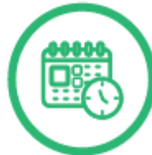
Daily Preparation Material